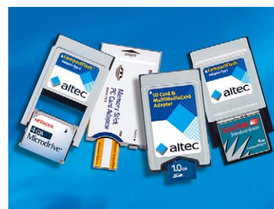
PC Card adapters let you use a wide range of memory media